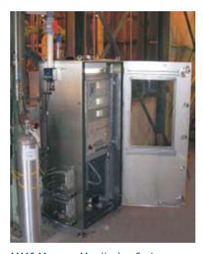
MMS Mercury Monitoring System installed at a hydrogen plant

Measurement data are stored on hard disk as ASCII- and EXCEL files. Filed data can be retrieved at any time as graphic diagrams. A friendly search function enables the user to find quickly data of selected time intervals or data exceeding a threshold value.