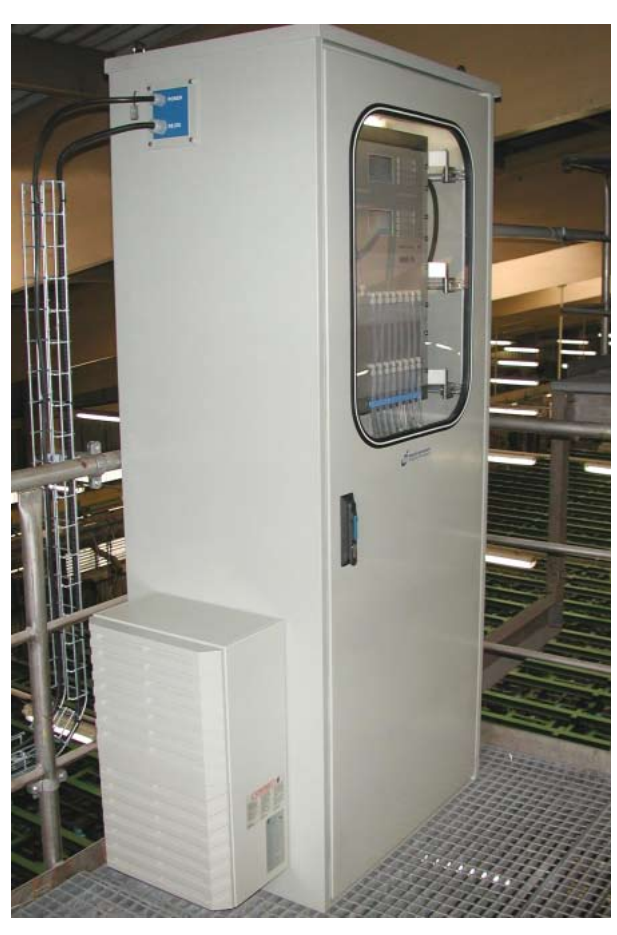
MMS: Installation of a 16-channel MMS in a chlor-alkali plant for cellroom monitoring

Stand-alone operation without connecting to a PC is also possible.